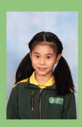
- Well-being Leader