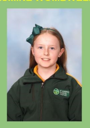
- Arts Leader